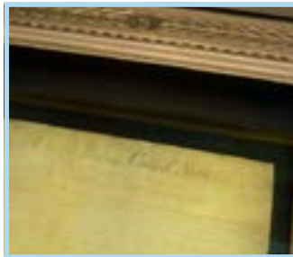
Original "Bill Of Rights"