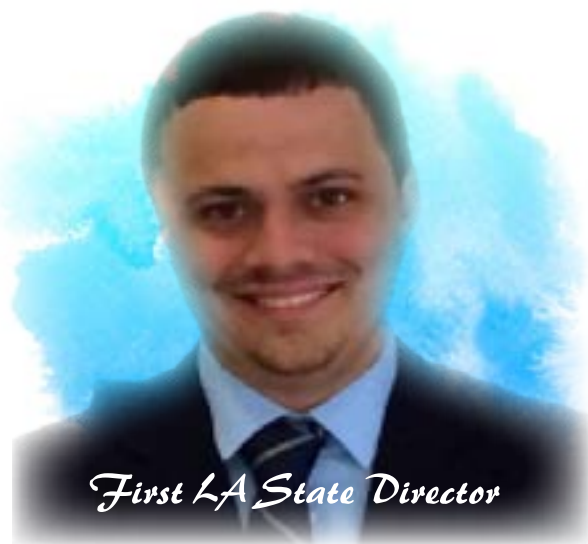
First LA State Director