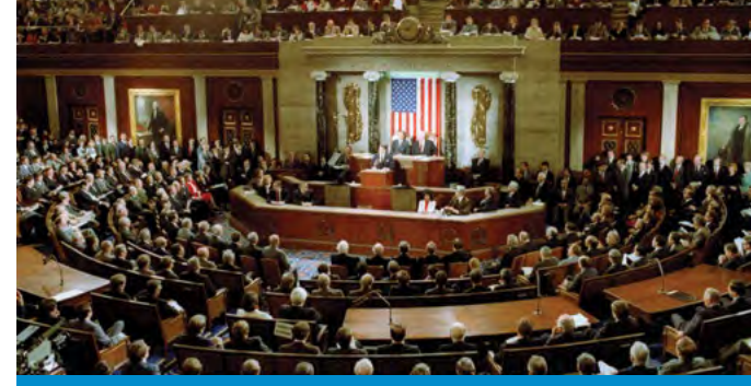
Congress is acting in a limited administrative capacity on behalf of the states. It has no authority beyond that, including no control over the delegates.

on the same topic. In legal terms, this is referred to as a "ministerial" role. In this role, Congress is acting in a limited administrative capacity on behalf of the states. It has no authority beyond that, including no control over the delegates.