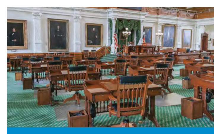
Each state has the power to choose its own commissioners in its own way.

States are free to develop their own selection process for choosing their delegates—properly called "commissioners." Historically, the most common method used was an election by a joint session of both chambers of the state legislature. This is true federalism in action. Each state has the power to choose its own commissioners in its own way.